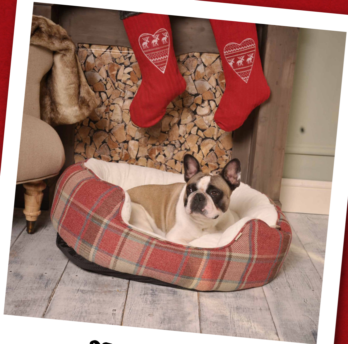
PET OVAL BED