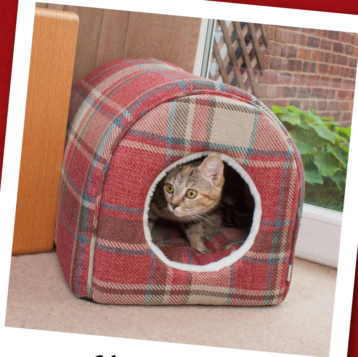
CAT IGLOO BED