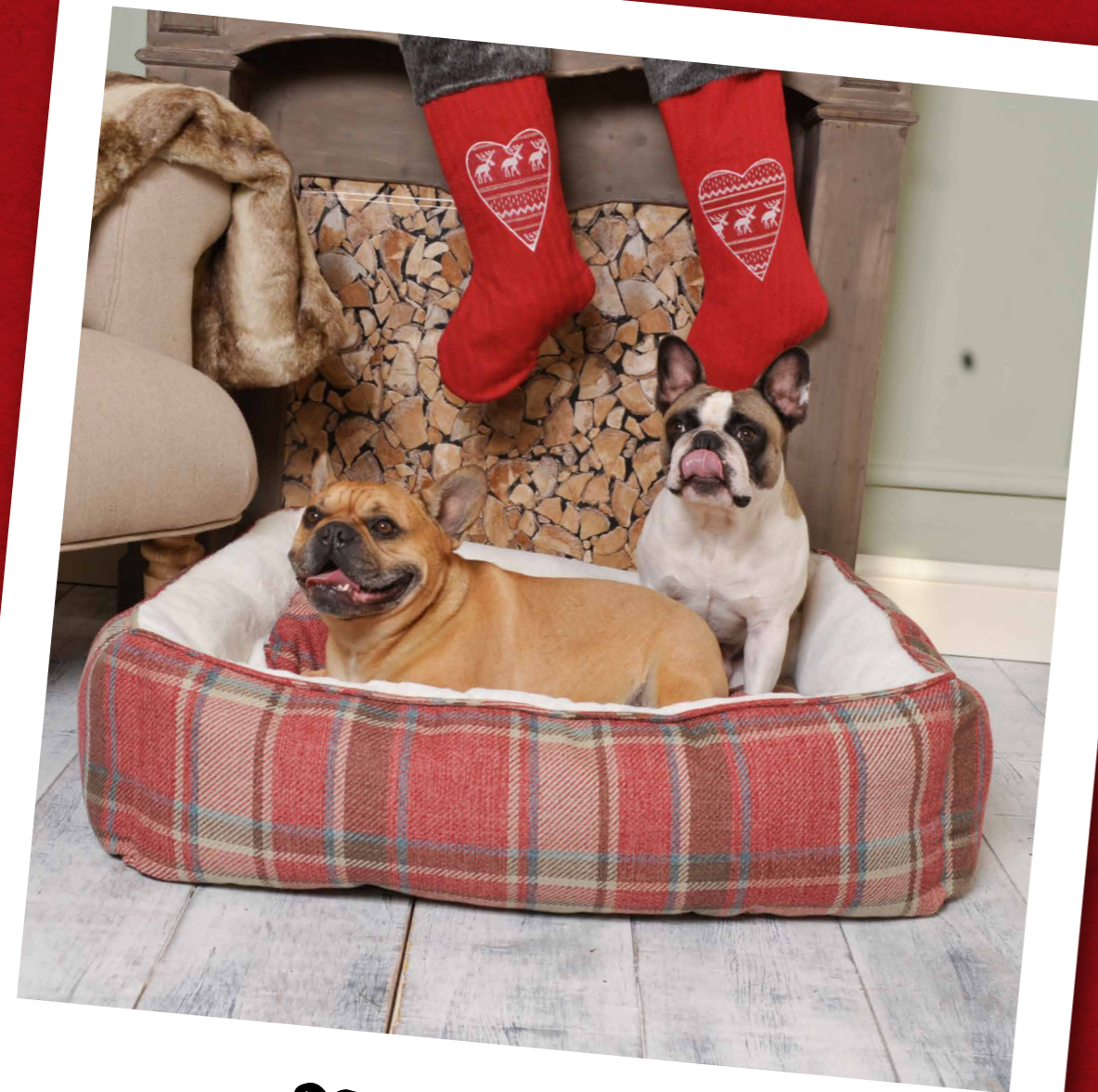
PET SOFA BED