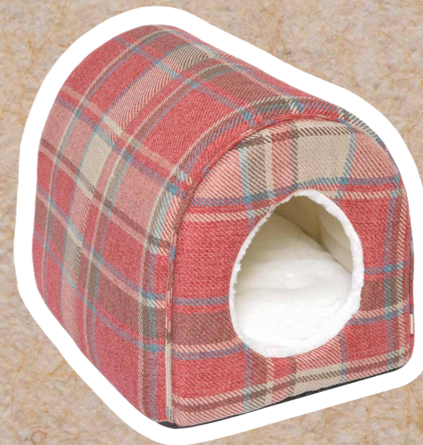
CAT IGLOO BED